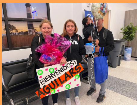
Welcome to New Bern