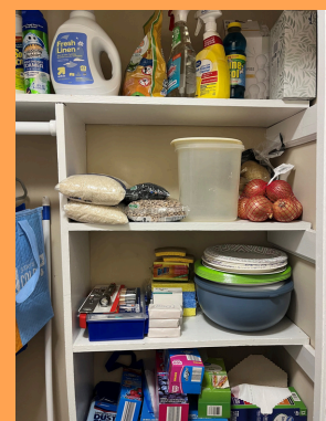
Stocking the pantry